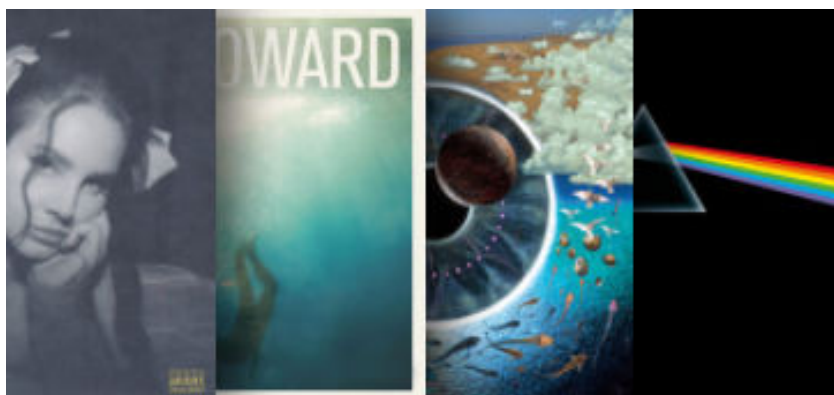
HF&MS Rega ELEX Mk4 playlist