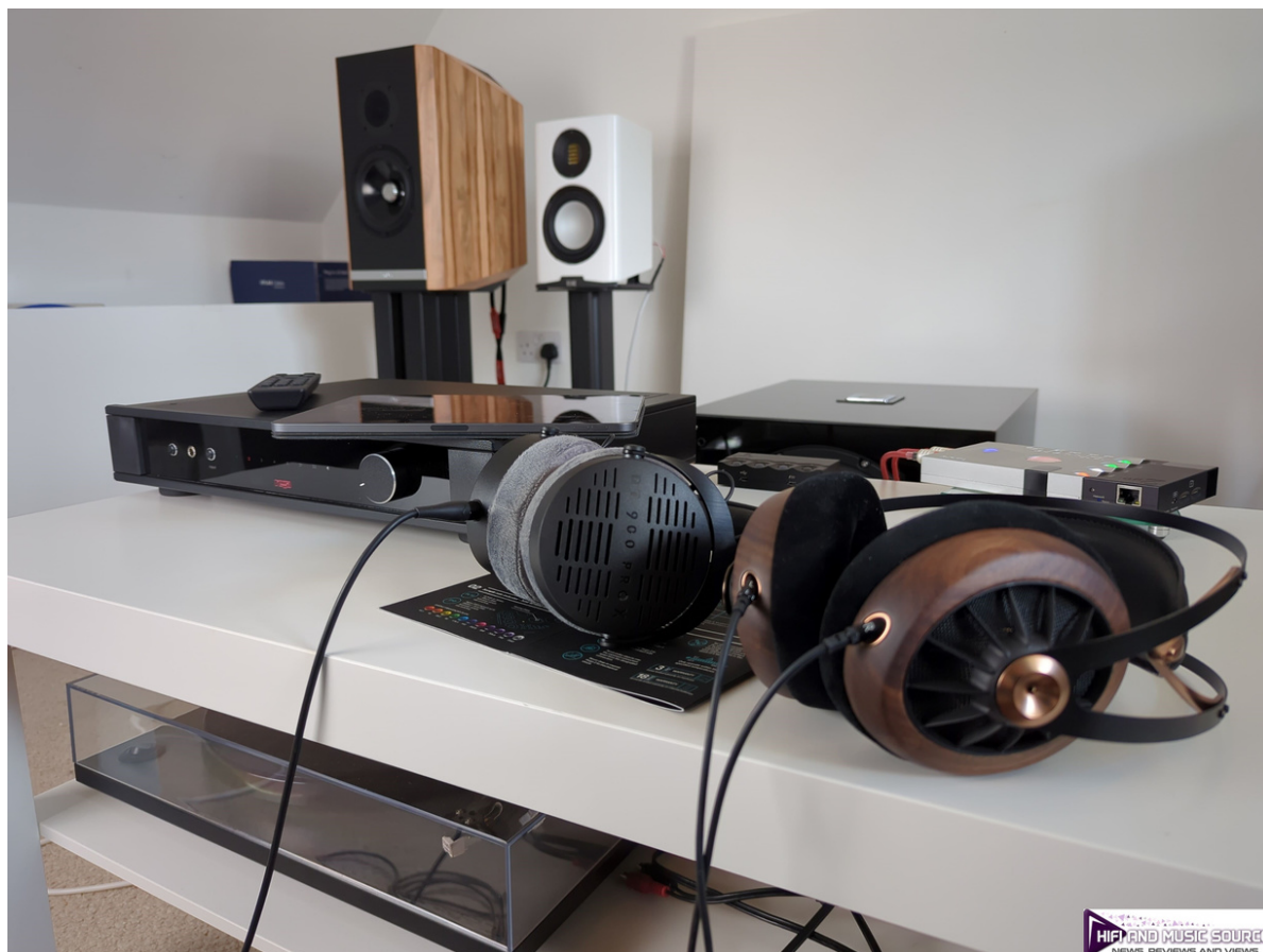
Rega ELEX Mk4 is under test with Meze Audio 109 Pro headphones and ELAC Carina loudspeakers (white)

The dimensions are (W x H x D) 432mm x 82 x 340 (D includes loudspeaker terminals). In old money, this is 17 x 3.25 x 13.4 inches. The ELEX weighs in at 11kg (or 24.3 lbs). Price; £1,199 in the UK.