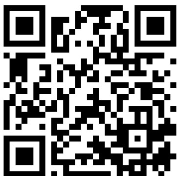
Scan me to see the Rega ELEX Mk4 playlist

Here's the Musical Interlude playlist, it is the 50th Anniversary of Dark Side of the Moon this month hence the heavy influence!