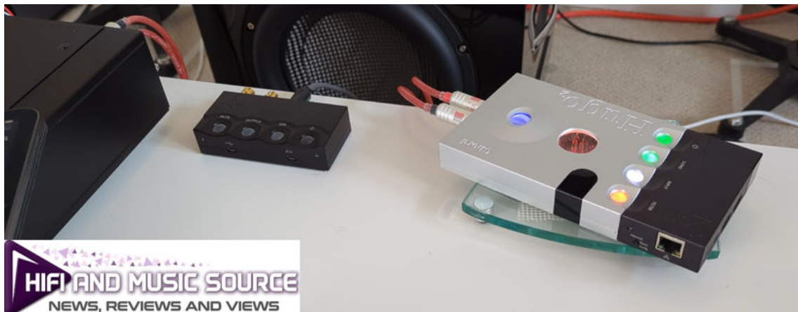
2Go/Hugo 2 and 2Go/2Yu for analogue and digital testing

There are obvious parallels to be drawn to the big brother Elicit Mk5 at £2,000 with more power as outlined above but at the 'normal' sound levels I'm using, barely at 10 o'clock, there is nothing amiss here and the detail and depth in Pink Floyd's Live album Pulse (2018 Remaster, Qobuz, 24-bit, 192kHz) is as engaging as required and I would wager a blind test may yield embarrassing results for many.